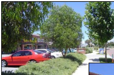
High Quality Landscaping & Footpaths