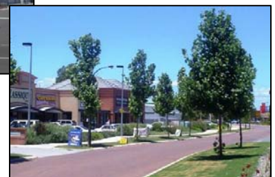
Street trees, pavement, relationship of development to the street