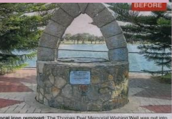
cal icon removed: The Thomas Peel Memorial Wishing Well was put into

Peel Memorial Well Built 1955 by the Mandurah Progress Association and funded by Public subscriptions. The Heritage Council of WA states that the well had historical and social significance. It was removed in 2015.