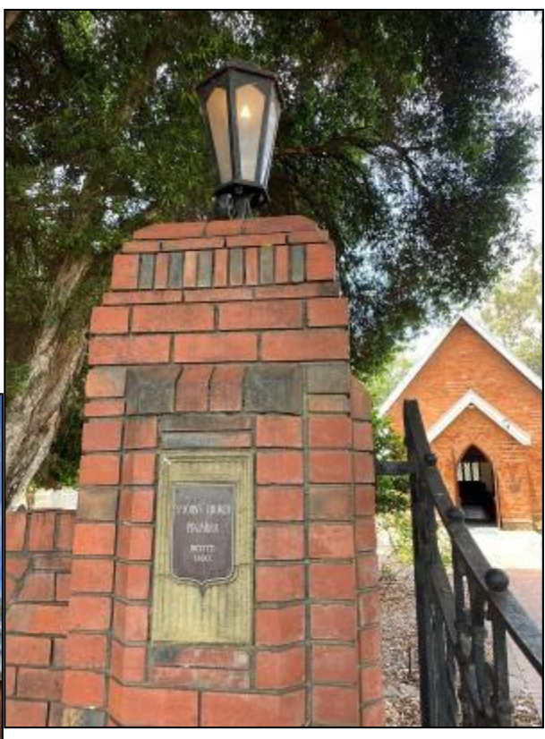
Left St. John's Church.