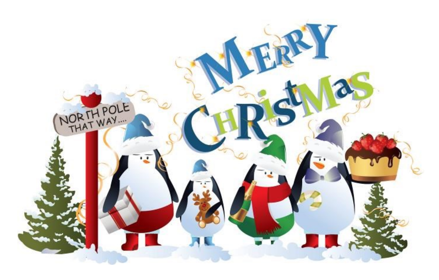
WISHING ALL OUR FRIENDS AND VOLUNTEERS A WONDERFUL CHRISTMAS AND A HAPPY AND SAFE NEW YEAR.