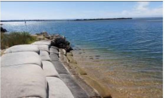
Views of the area near where we camped—as it is today. Trees dying, sand banks being eroded.

As water was a precious commodity and the local bore water undrinkable. Dad, who had a truck, would cart down a tank of rainwater a few days before Mum and I arrived. He would lay down tarpaulins and erect a borrowed canvas tent filling it with our camping gear as we had little room in our family car to carry such equipment. No fear of it being damaged or stolen when left in those days.