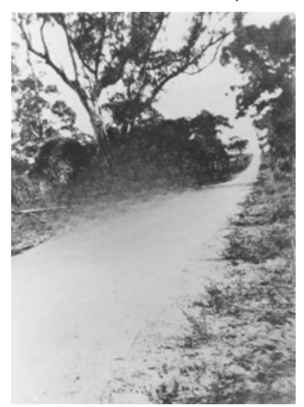
Above showing a fairly current view of the Lakeside Fruit & Vege Store. To the right sections of bumpy, limestone -based Mandurah Rd that still existed in the early 1950's.

To do this it was necessary to drive over the First Mandurah bridge and down the Coast Road.. The bridge was nearing the end of its life and had to be carefully traversed. Being a one way (planked single lane) thoroughfare, as tourist traffic increased, particularly in holiday periods, there was a manned, Stop- Go set up in the middle to assist flow. All very exciting to a young lad. By 1954, the new 'old bridge' (two lanes) was in service.